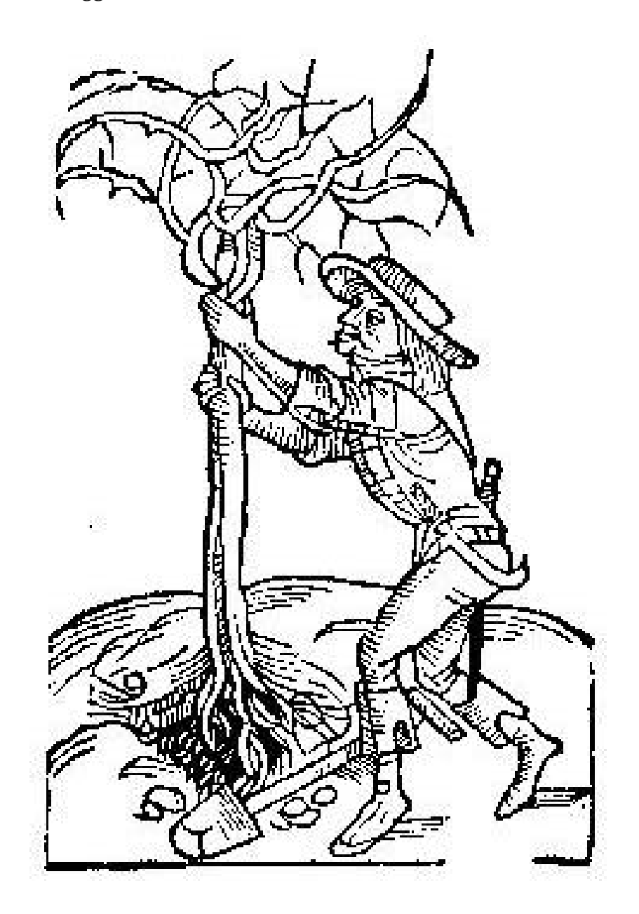
3. Planting a tree; from Petrus de Crescentiis, Opus Ruralium Commodorum , Speier, about 1493.