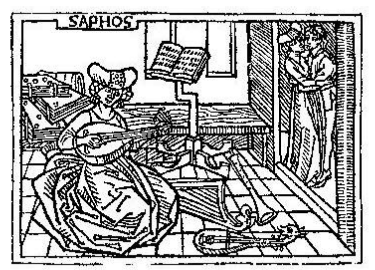
13. Sappho; from Boccaccio, De Claris Mulieribus, Augsburg 1473.